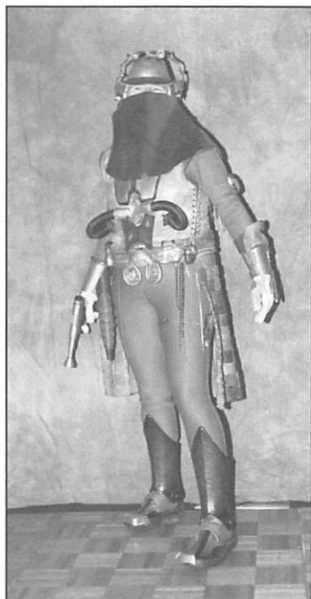
Zam Wesell Deunan Berkeley Copyright © 2009 Thom Walls