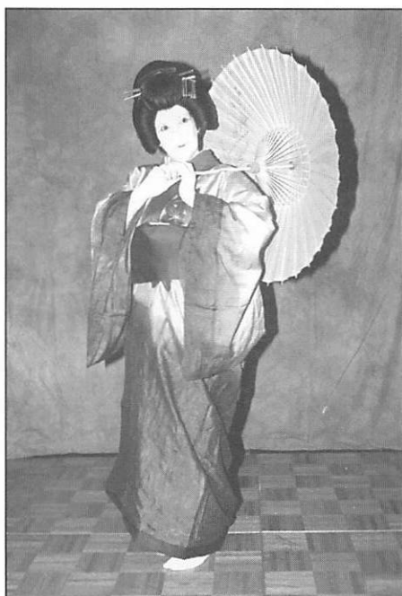
Shimabara Junju Redux April Faires