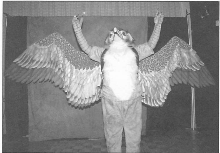
Legend of The Griffon Gary L Bell Copyright © 2009 Thom Walls